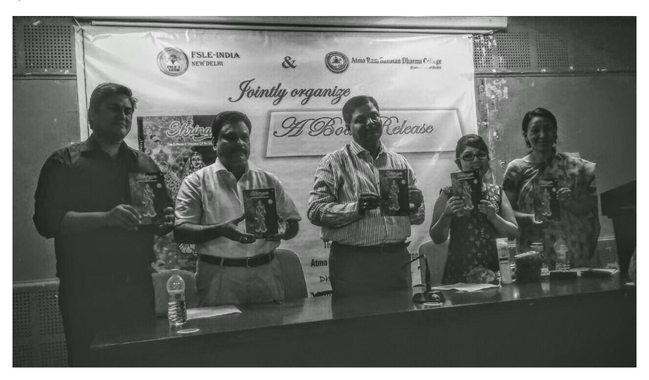
Shringaar: The Different Shades of an Indian Bride

The reason to promote this book was its bonhomie with Gender issues-one of the prime concerns of the LEGH Movement and also, intrinsically it adopts the idea of spiritual ecology. The Sixteen different phases of Moon is beautifully compared with the 16 types of Shringars of an Indian Bride.